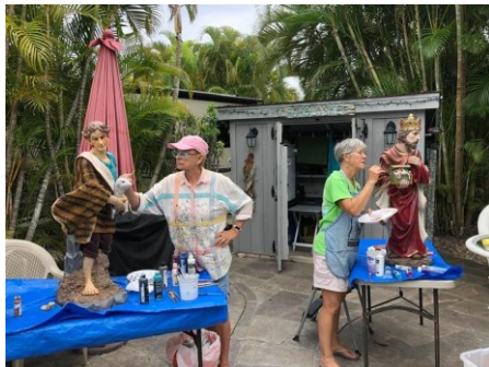
Painting takes concentration