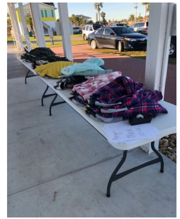
Once again, the Knights of Columbus of St. Finbar’s Catholic Church donated new warm clothing to the needy of our community. They were available at Food Distribution Wed. February 11 on first come.