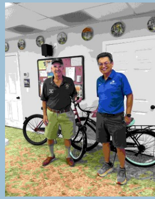
Bicycles donated to a local family by Knights of Columbus of St. Finbar’s Catholic Church