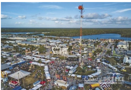
EVERGLADES CITY SEAFOOD FESTIVAL ECC is the white steeple Church seen on the Fairway in the middle of picture on the extreme right edge.