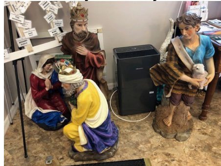
Inside church drying 2023