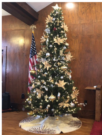
EVERGLADES COMMUNITY CHURCH CHRISTMAS TREE 2022

THERE WILL BE NO CHRISTMAS EVE SERVICE ON SATURDAY EVENING THIS YEAR. WE WILL CELEBRATE CHRIST'S BIRTH ON CHRISTMAS DAY AT OUR REGULAR SUNDAY SERVICE AT 11:00 A.M.