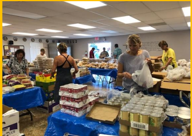
SOME OF OUR 15+ PANTRY WORKERS

The numbers speak for themselves. We have a ministry reaching into over 115+ homes per week feeding an average of 246+ persons every week. God is good!