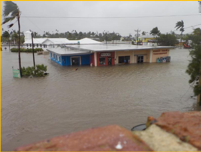
Stahlman's Grocery with ECC behind