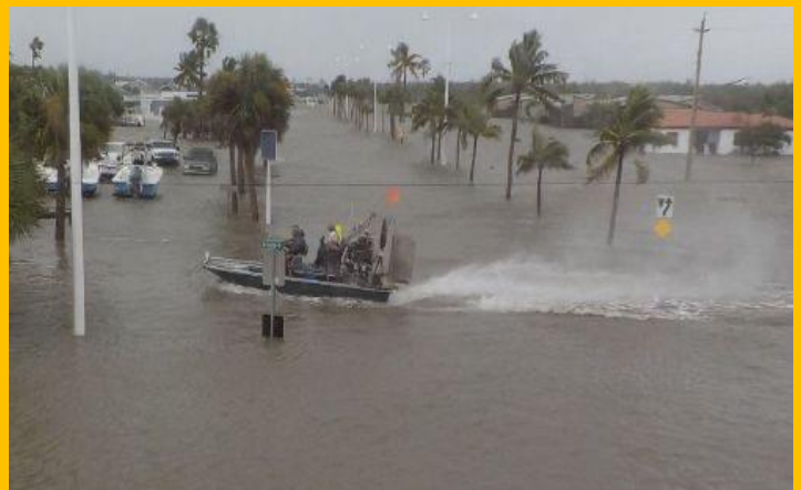
Corner of Broadway and Collier Ave. S.R.29. (Seafood Depot to right out of picture)