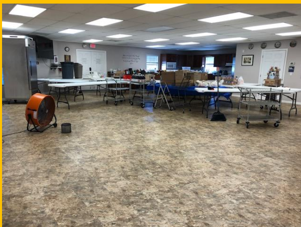
Jinkins Fellowship Hall drying out four inches of water.

It's been five years since our last hurricane, Wilma. Yes, we had damage from water with Ian. But not the mud we had with Wilma. Four inches of water came into Fellowship Hall, but thankfully, no water entered the Sanctuary. Our custodial staff will be able to clean out the water and prepare the floor for inspection of damage by removing some tiles. If there is damage the floor will have to be carefully removed as the tiles are of the type we can put back down, However, our mechanical equipment did not fare as well. We lost three of our refrigeration equipment used for Food Distribution.