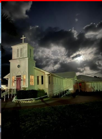
Photo of Everglades Community Church.